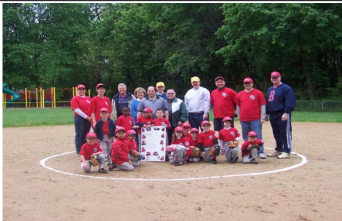
The Wilhelm-Paxtang Athletic Association t-ball team (The Lions) thanks the Paxtang Lions Club for their sponsorship!