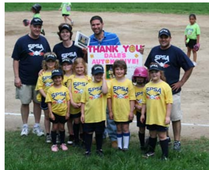
The Swatara Paxtang Softball Association T-Softball team - The Bone Crushers - thanks their sponsor, Dale's Automotive.

Christmas at Fort Hunter, Tour of the Mansion that will be decorated for the season. Free to PHS Members, more to follow.